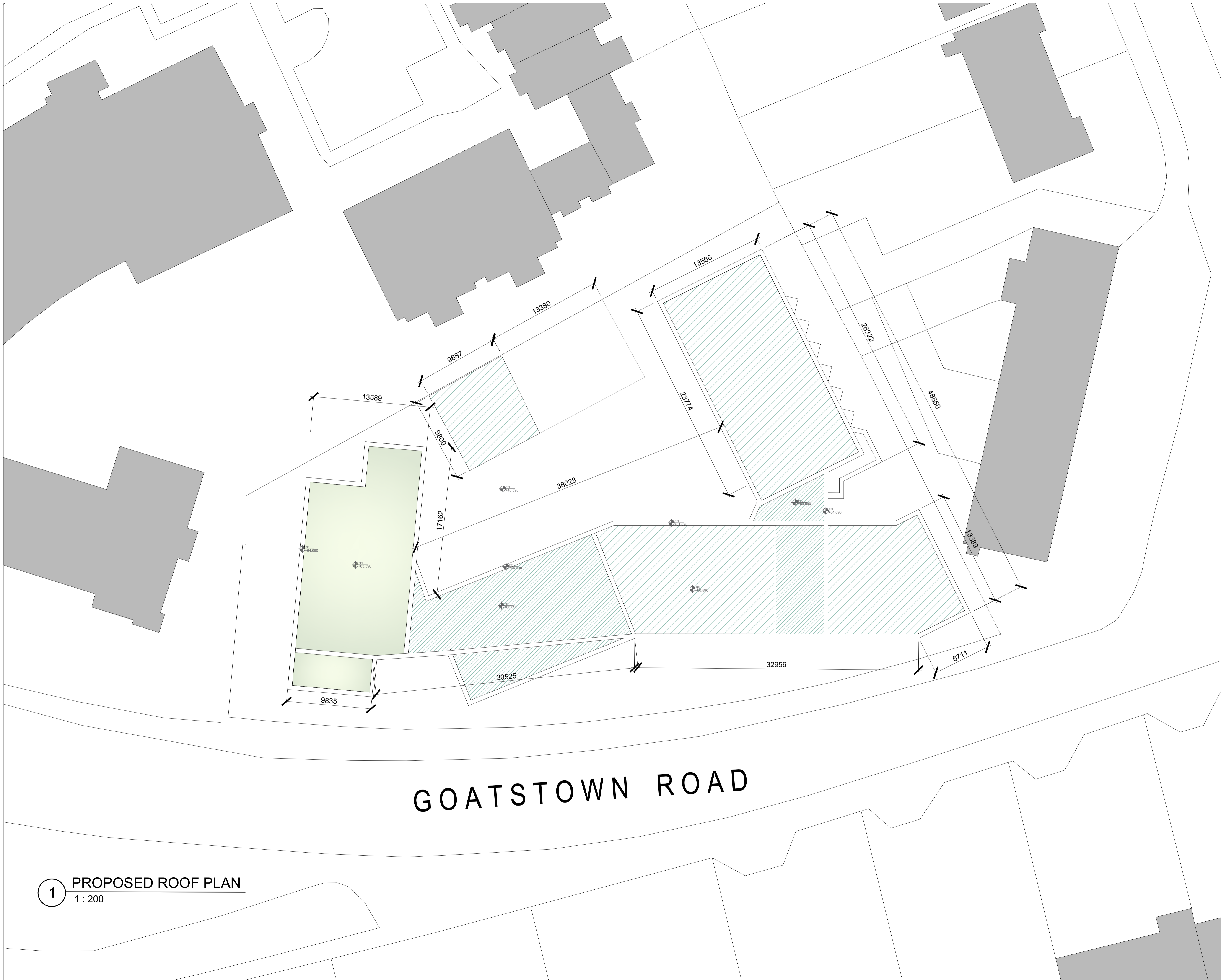
1 PROPOSED ROOF PLAN 1 : 200

Notes: DO NOT SCALE FROM THIS DRAWING. USE FIGURED DIMENSIONS IN ALL CASES. VERIFY DIMENSIONS ON SITE AND REPORT ANY DISCREPANCIES TO THE ARCHITECTS IMMEDIATELY. THIS DRAWING TO BE READ IN CONJUNCTION WITH THE ARCHITECTS SPECIFICATION. © THIS DRAWING IS COPYRIGHT AND MAY ONLY BE REPRODUCED WITH THE ARCHITECTS PERMISSION.